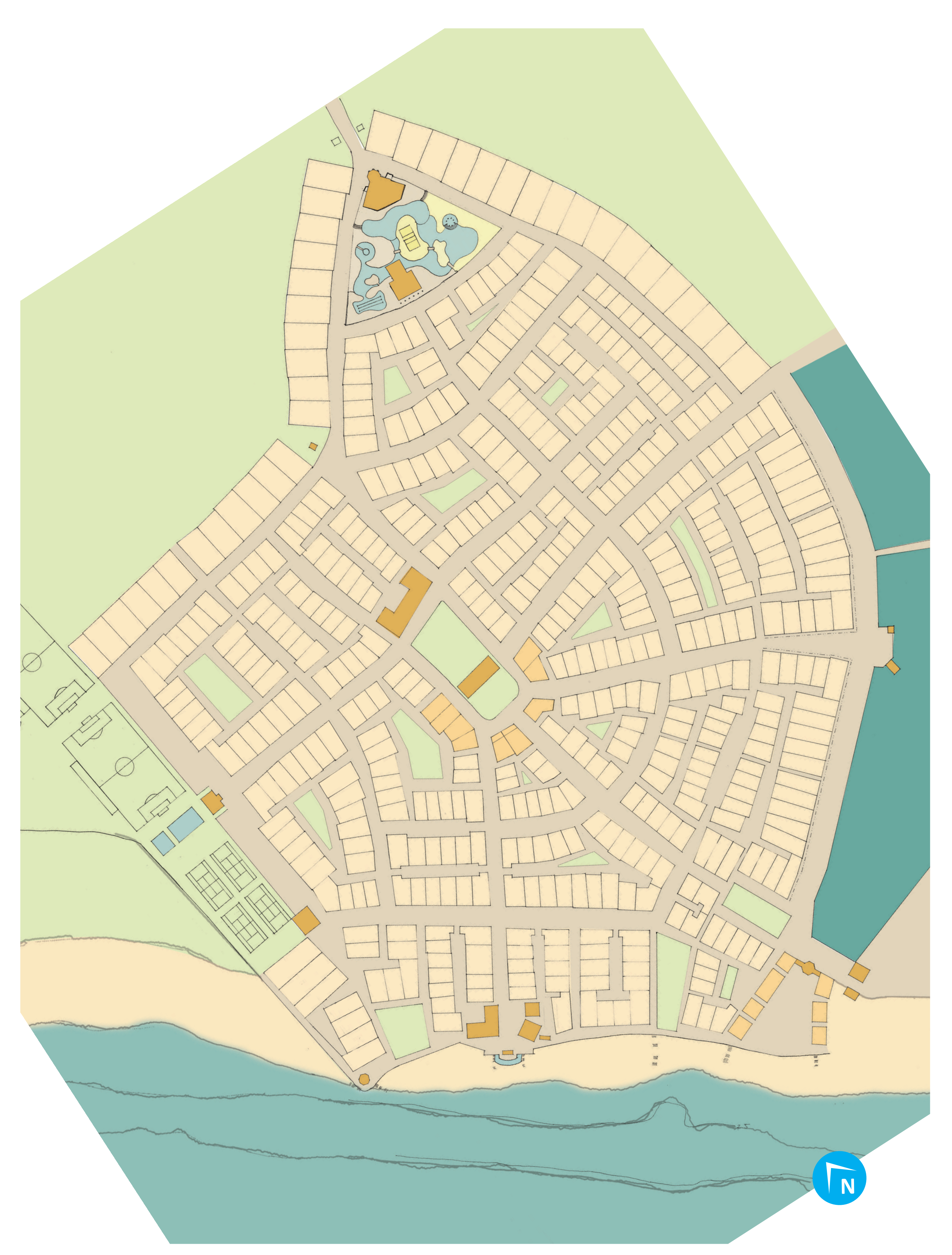
BAHIA MUYUYO, GUAYAS, ECUADOR