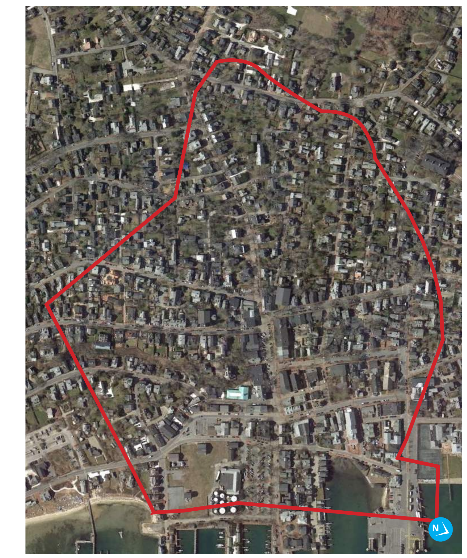
NANTUCKET, MASSACHUSETTS, USA