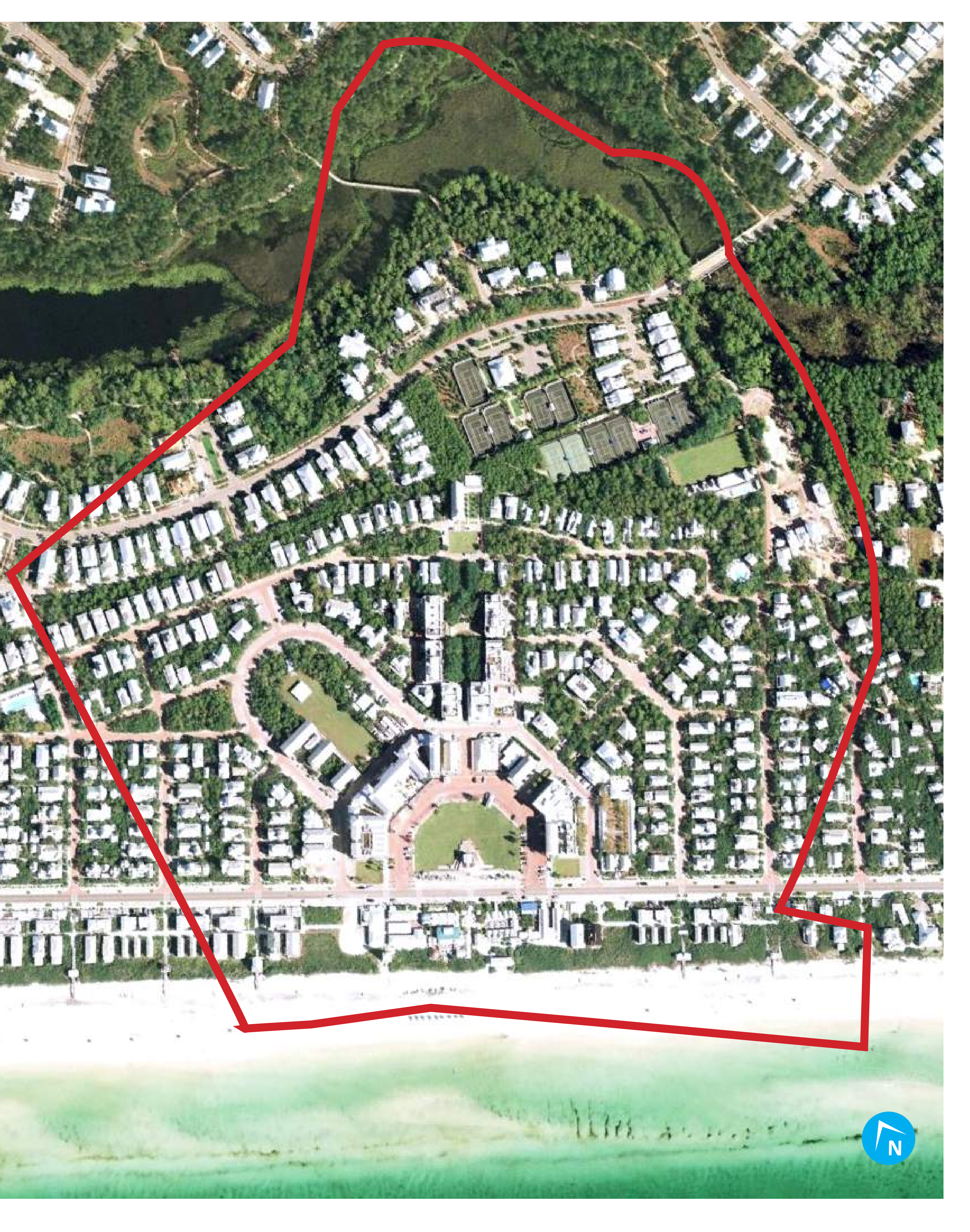
SEASIDE, FLORIDA, USA