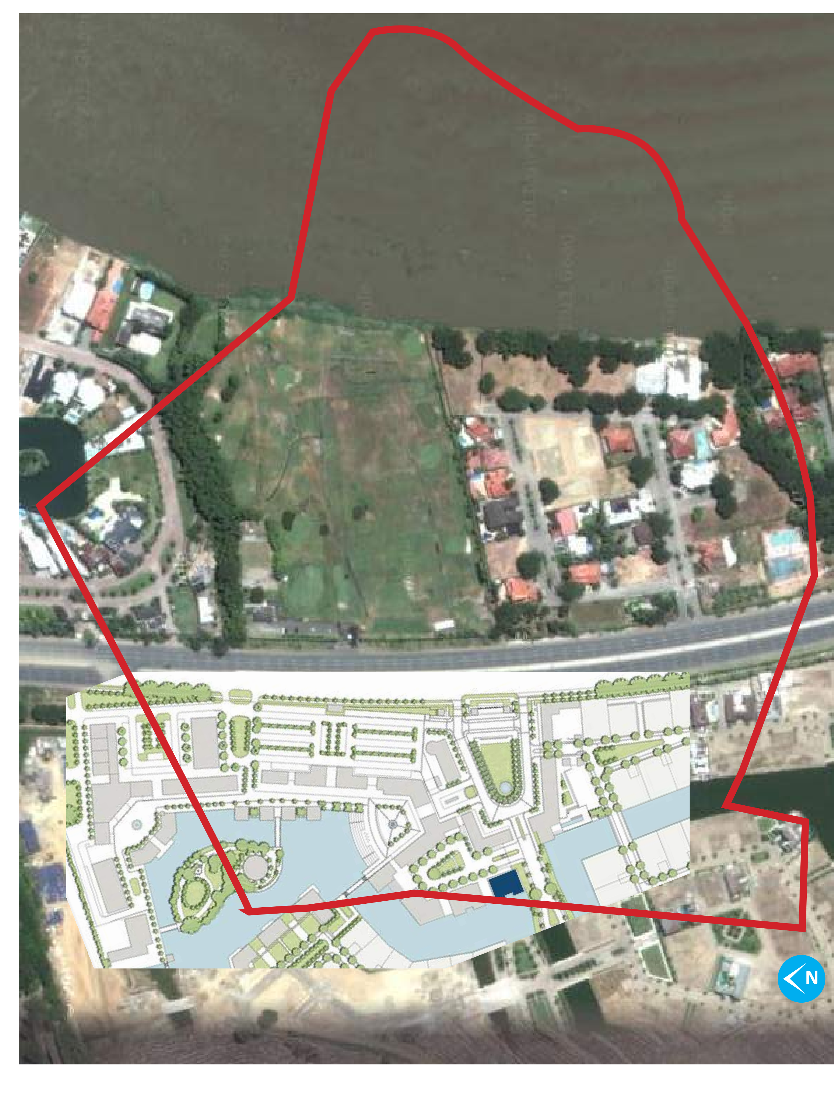
BATAN, SAMBORONDON, ECUADOR

• DIVERSE COASTAL BLOCK STRUCTURE (SYSTEM OF PATHS, VEHICLE ALLEYS, ETC)