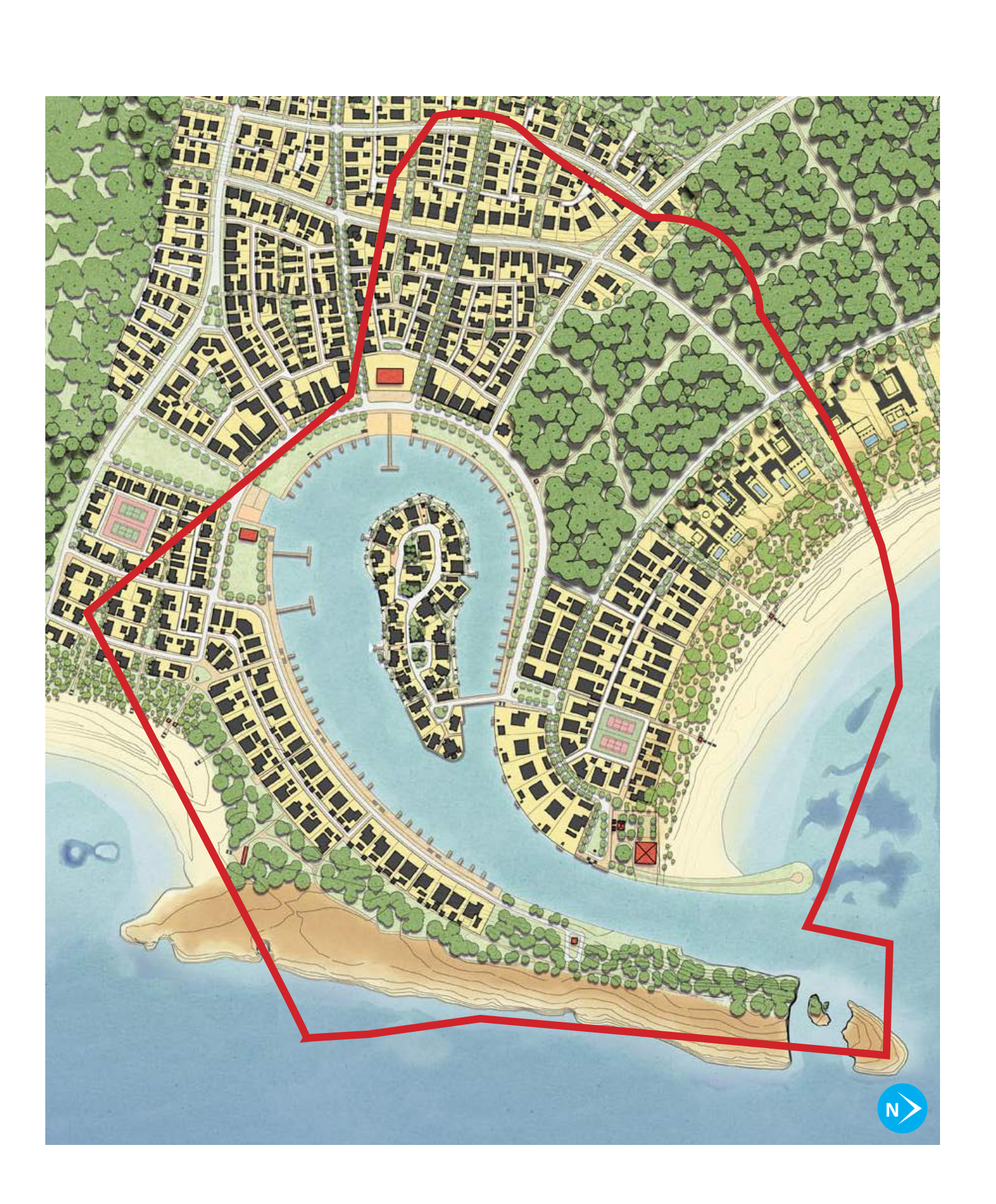
SCHOONER BAY, GREAT ABACO ISLAND, BAHAMAS